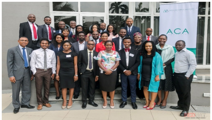
Achievement Nigeria and Nigerian Economic Summit Group NESG.